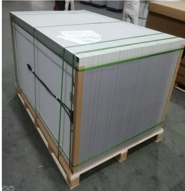
Current Packaging (physical image)