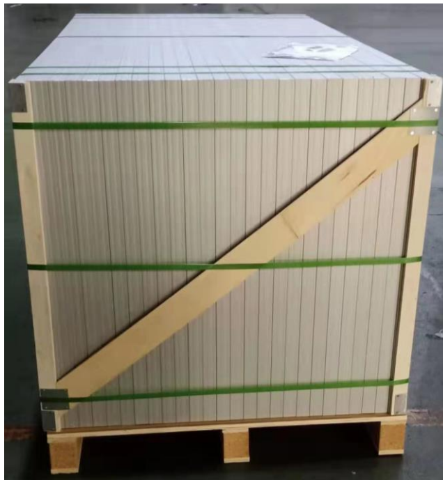
New packaging box with protection frame (physical image)